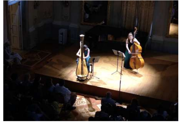
How I met Puccini® in Teatro La Fenice, may 2022

On the 100th anniversary of Puccini's death, this project offers an innovative performance experience that has already proven its success in european concert halls (such as Teatro La Fenice in Venezia or Teatro Argentina in Roma) and with a fantastic US debut at the International Society of Bassists in June 2023. An unique occasion to appreciate Puccini's great lyricism and ability to create descriptive themes in a minimalist way. The chamber duo combination highlight the connections with the musical genres of the 19th and 20th century and classical contemporary music.