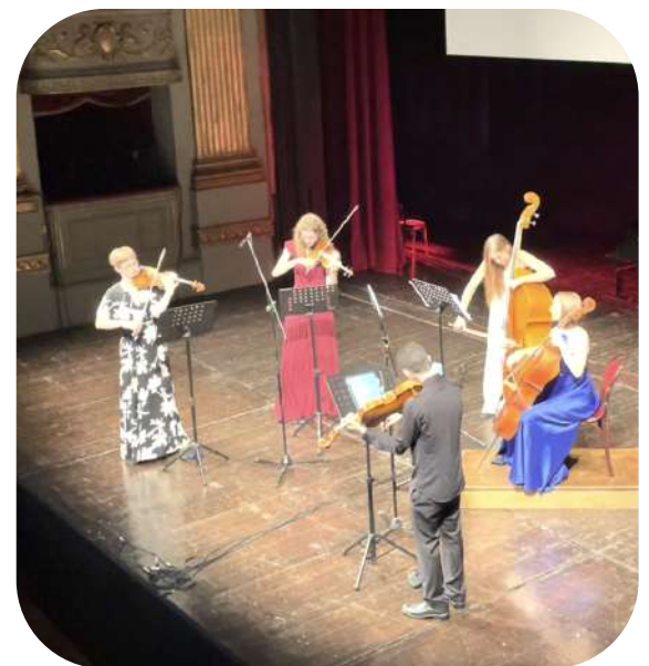
Teatro Argentina Roma, June 2022